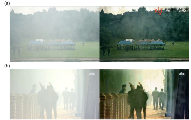
Figure 2. Real-world refinement results: (a) military smoke, (b) outdoor fire scene.

conventional approaches that depend solely on deep learning, the proposed framework acquires reliable input from the outset, enabling interpretable and accurate refinement. This sensing-first strategy represents a shift from restoring degraded images to proactively capturing resilient signals, offering a robust and scalable foundation for use in safety-critical environments such as disaster response, field robotics, and public security.